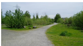
Salish Ponds Wetland Park

Public comments are being accepted on the